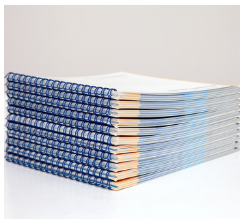
TAKE HOME MATERIALS